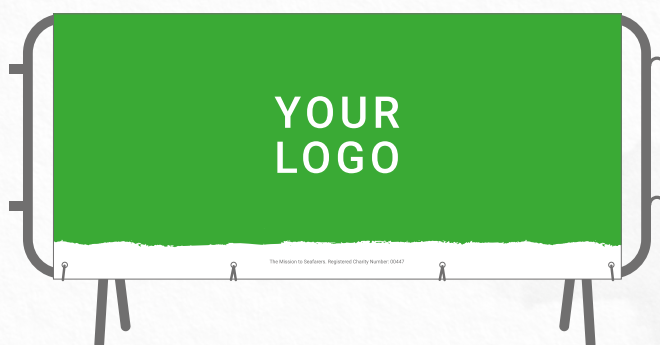
START/FINISH BARRIER JACKETS